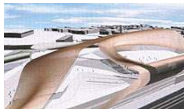
Model of modern metallic Islamic mosque

Britain already has more than 2,000 mosques. No other country in Western Europe has more. Now, London may become home to a mega-mosque and many people are raising a fuss about it. Two hundred thousand people have signed a petition to stop construction. VOA's Mandy Clark reports from London.